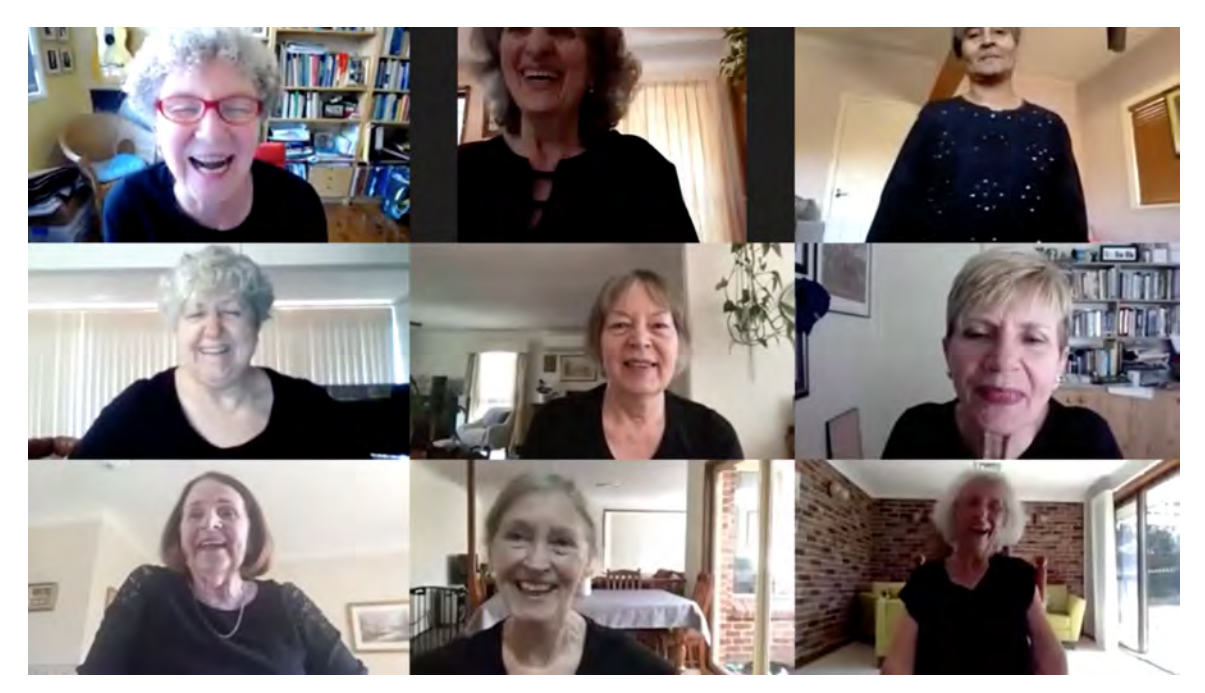
The dancers are having fun on our black themed session, singing along to AC/DC!

The creative objectives of Together We Dance were two-fold: creating group movement ideas and choreography specifically for the frame. Inspired by film director Mike Figgis, whose film Timecode (2000), brought choreography to the fore as the film is a totally improvised piece of cinema shot on a hand-held camera for 90 minutes in real-time. After participating in a workshop with Figgis in Amsterdam in the early 2000s, I was inspired to create my own split screen film, Super Power (2011), which screened in over ten international film festivals. My introduction to split screen, through Figgis, had taught me to consider my choreographic and editing options whilst filming, and to execute both roles, filming and editing, in consequence to each other. In this sense, editing becomes another choreographic device.